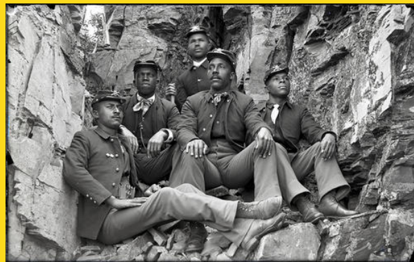
African American soldiers from Fort Missoula.

MSL added primary sources to the Montana History Portal, including teacher curated exhibits for K-12 education. The Portal reached 6.9M people through social media in FY 22, connecting new audiences with Montana's rich cultural history.