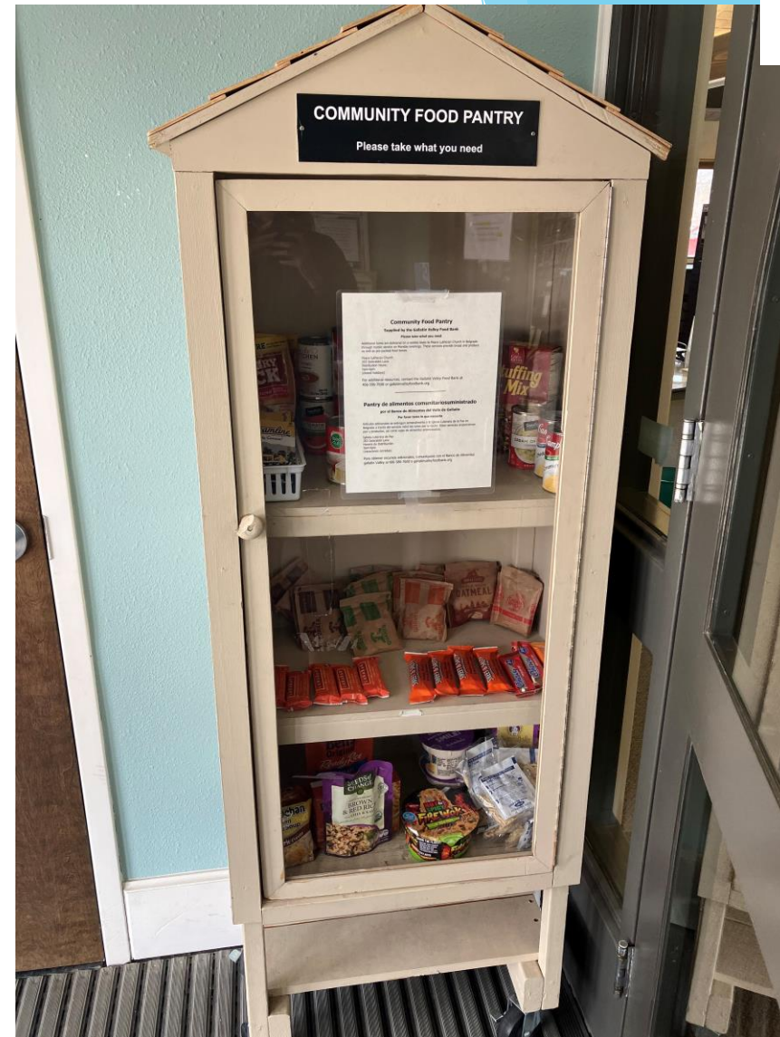
Belgrade Community Library Belgrade, Montana