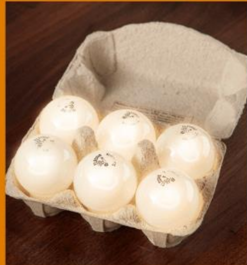
Food or electricity?