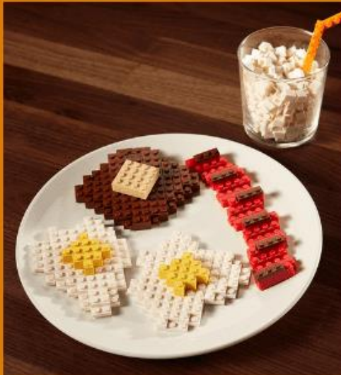
Food or childcare?