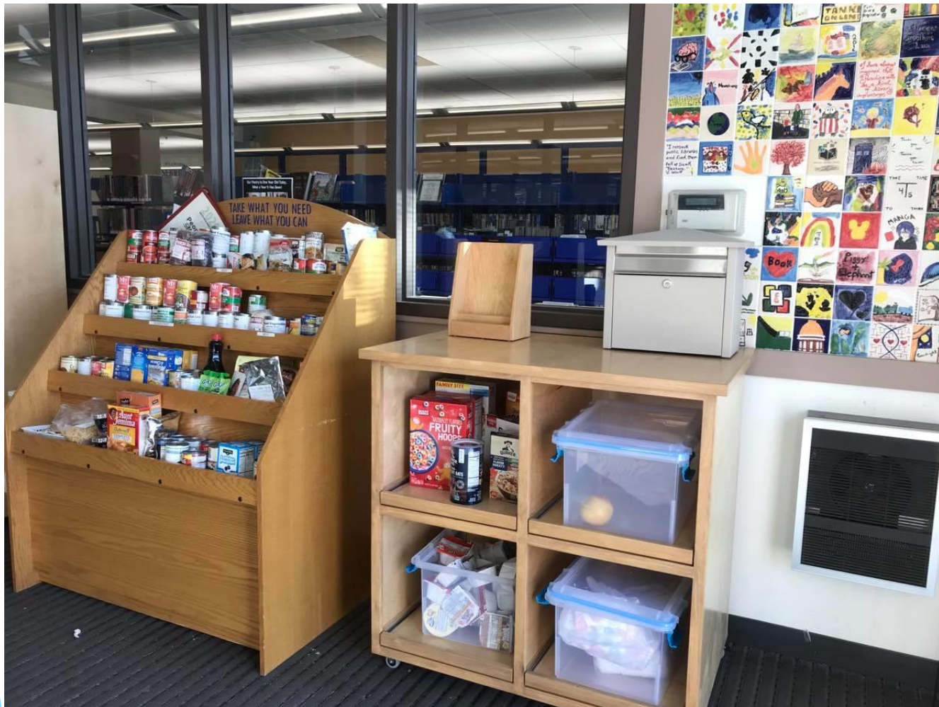
Woodstock Public Library Woodstock, Illinois