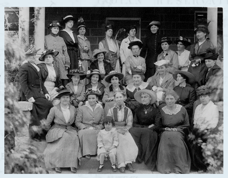
Fort Benton Women's Club