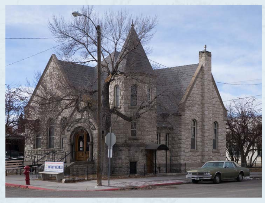
Carnegie Library, Dillon, MT