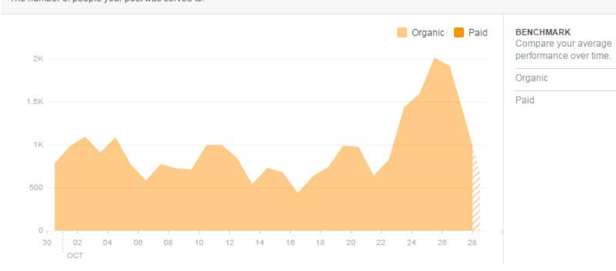
10/28/2015 4:45 PM - Screen Clipping

The number of people your post was served to.