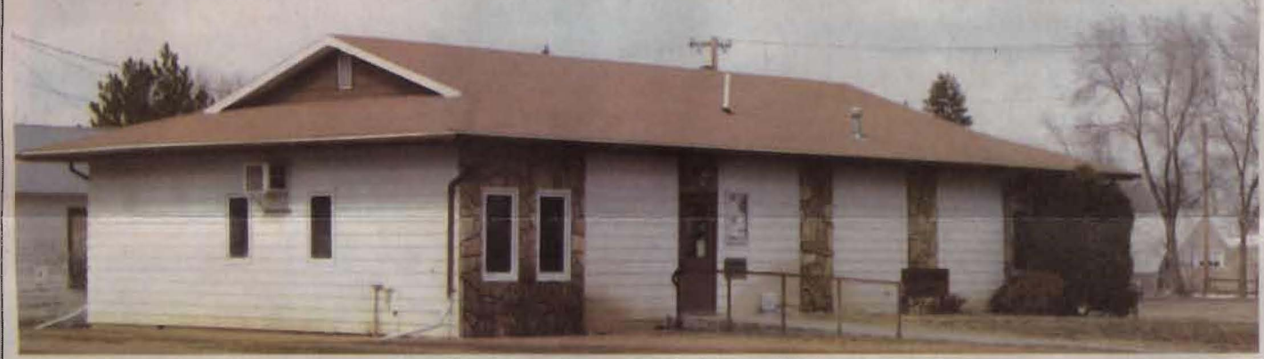
The library, pictured above, is a popular after-school stopping point for students, such as these teens from Terry High School, top right.

that will make finding books and other resources even easier.